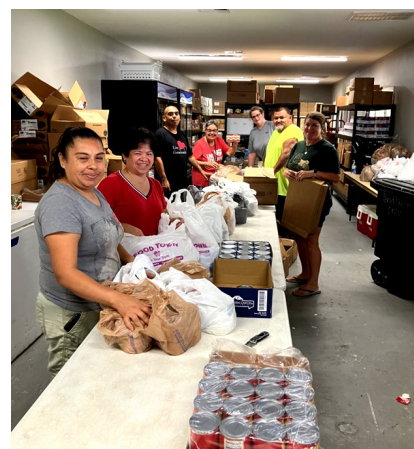
Our food Pantry volunteers getting their annual Civil Rights and Food Safety training.