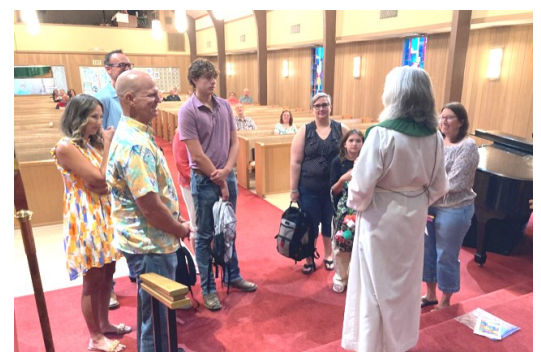
Back to School Blessing on Sunday, August 13th