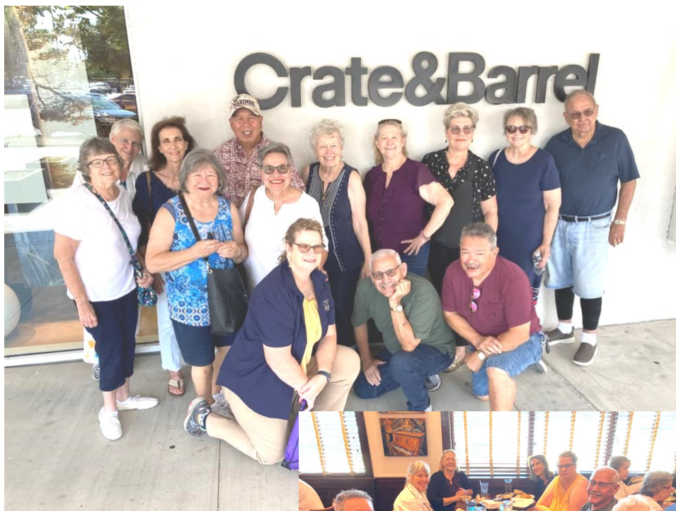
Golden Group Trip- Shopping on Westheimer