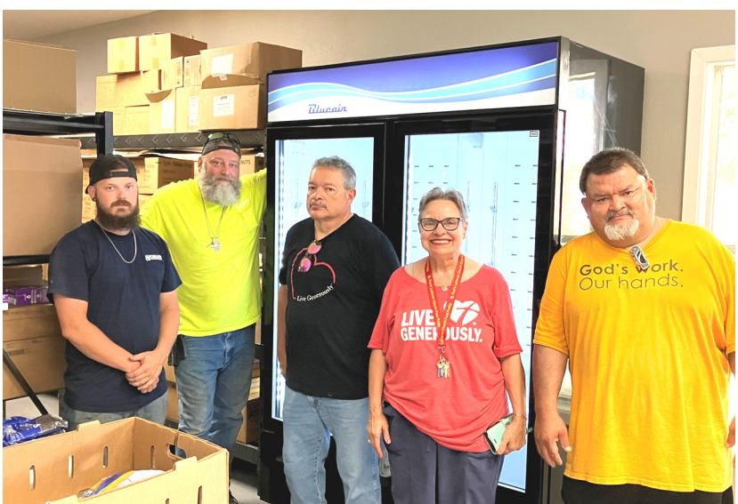
Thanks to a Capacity Grant awarded from the Houston Food Banke we were able to get another commercial merchandizer for our Pantry. Thank you Houston Food Bank! And thank you to our Food Pantry volunteers for all their hard work. We couldn't do it without you!