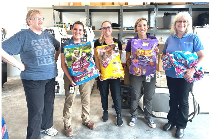
The Baytown Animal Shelter was thrilled to get the pet supplies we collected for our annual Prayer for Pets.