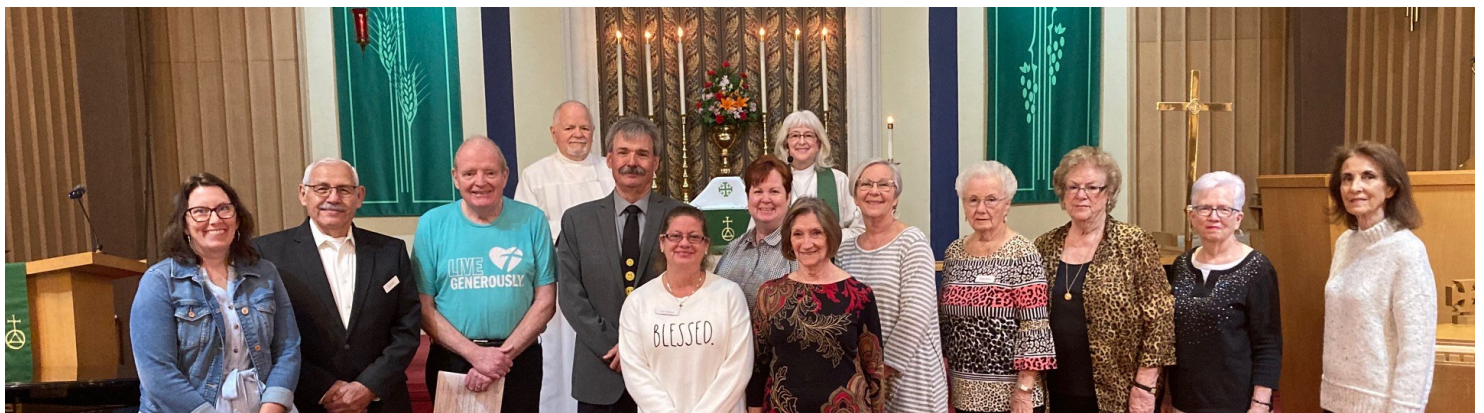
Installation of the 2024 Church Council