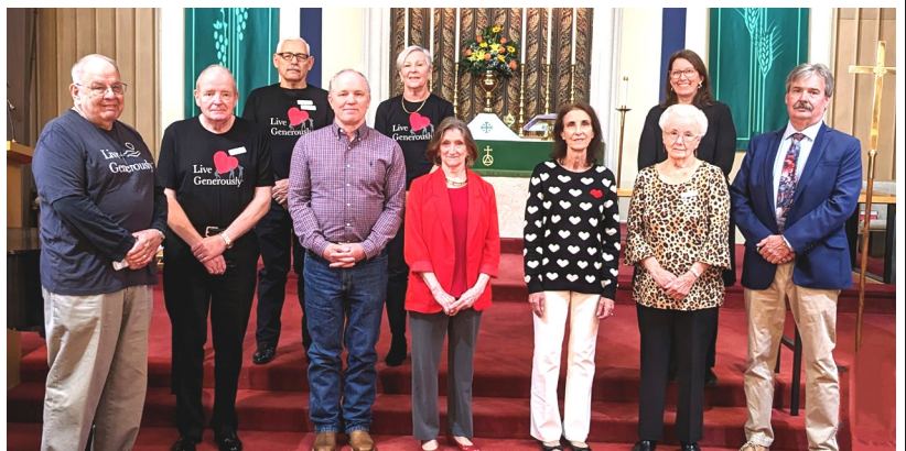
Installation of the 2023 Church Council 2/5/23