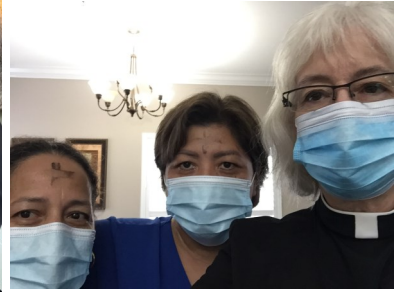
Pastor put ashes on some of the staff at Rehab on Main Street