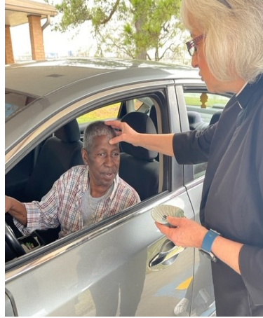
Ashes to Go!