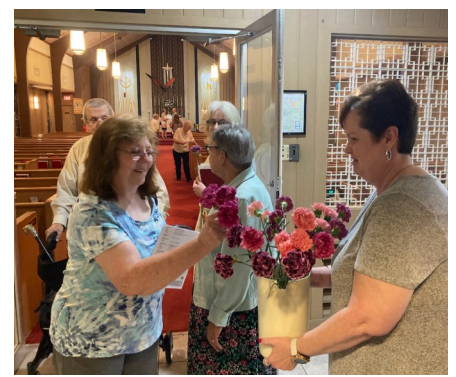
Flowers for Mother's Day