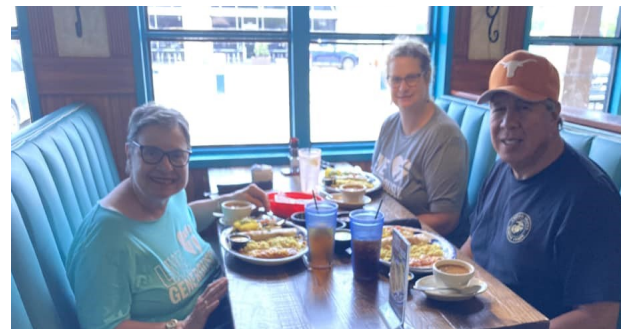
Golden Group Luncheon at Gringo's 4, in La Porte