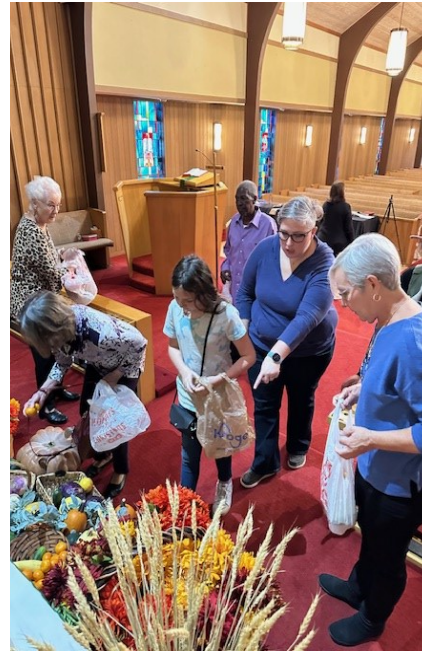
Service of Thanksgiving and Praise harvest altar. Everyone enjoyed the bounty.