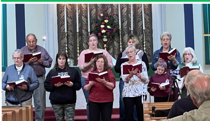
The Jubilee Choir singing praises to the Lord!