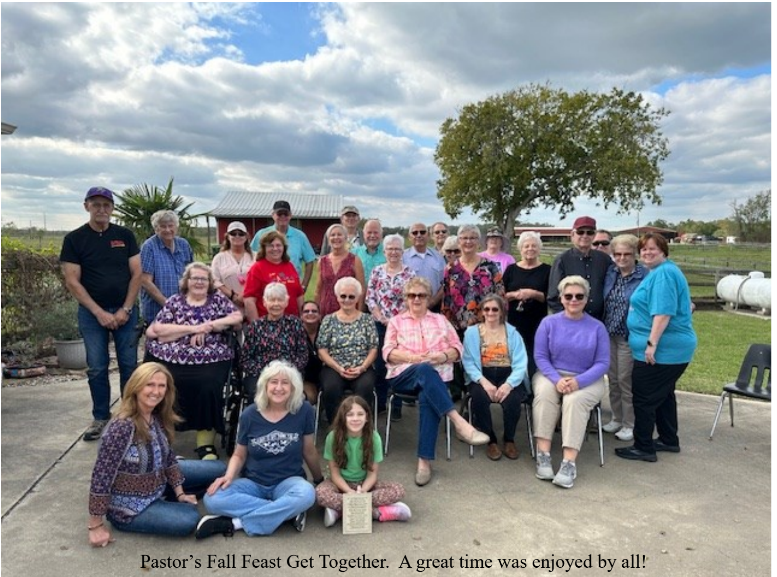
Pastor's Fall Feast Get Together. A great time was enjoyed by all!