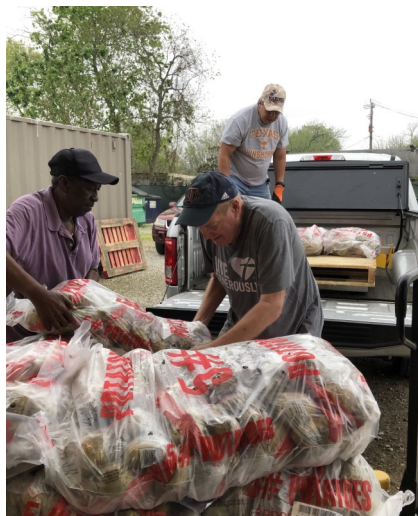
Spudtacular!!! The Food Pantry is blessed!