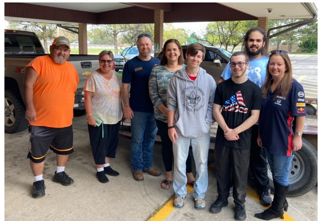
Thank you to Boy Scout Troop 208 for donating 1200 canned goods to our Food Pantry!