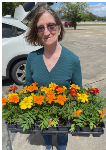
The Golden Group Trip to Maas Nursery was enjoyed by all. What a great way to welcome Spring!