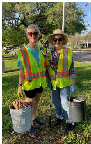
Standing by our sign! A proud moment for the Adopt-A-Spot Group!