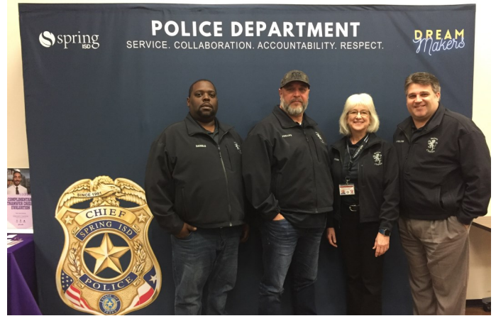
First Responder Chaplain/Peer Support Course Level 3. Held at Spring ISD Police Department.